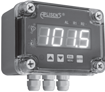
M12x1,5 cable gland