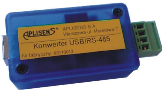
PIC.2 Converter output terminals – view from housing base.